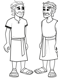
Peter and Andrew