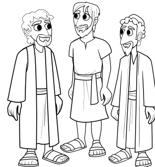
Thaddeus, Simon and Judas